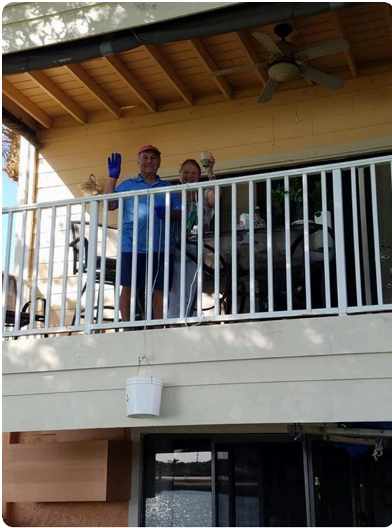
Neighborly Cheer, Not Held Down by COVID