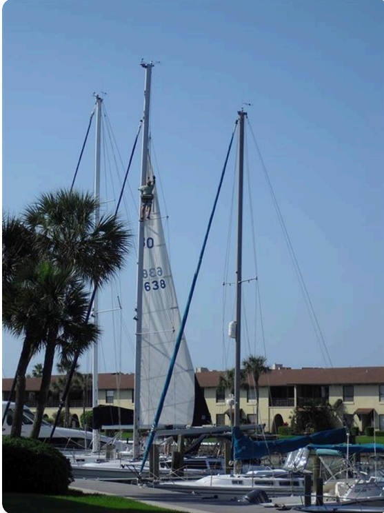
70 Years Young, Climbing the Mast